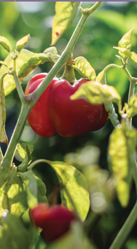
Peppers grown in Irvine at Harvest Solutions Farm, a 40-acre farm program of Second Harvest Food Bank of Orange County.