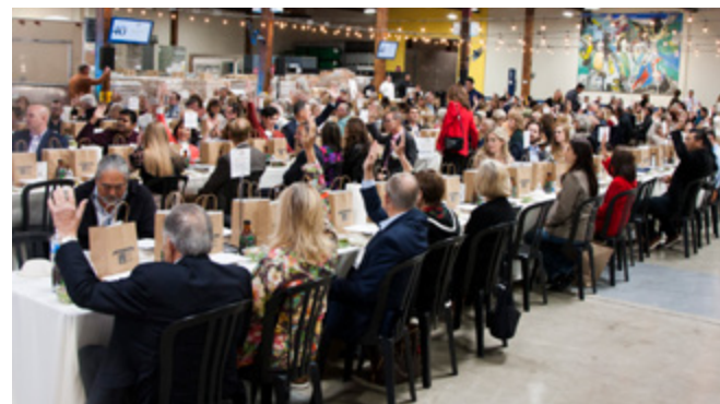
Guests in attendance at “No Lunch” Lunch.

We extend our appreciation to our presenting sponsor