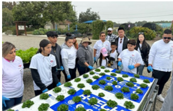
Members of Bank of America's Hispanic/Latino Organization for Leadership & Advancement (HOLA OC) at Founders Farm. The group has committed to volunteering monthly at the Farm.

Founders Farm addresses many of the challenges that we face today. Beyond the obvious of providing our neighbors with access to nutritious food, Founders Farm is an answer to the shortage of available land on which to farm. The crops grown at the Farm are cultivated in soil above ground using regenerative organic techniques and cost-effective growing systems deployed over man-made surfaces. Additionally, with its Orange County location near the Food Bank, Founders Farm is locally grown not far from the more than 300 food distribution sites of Second Harvest's partners, ultimately reducing its carbon footprint by greatly lessening the number of "food miles" traveled. Founders Farm is made possible by a generous lead gift from Bank of America in 2021.