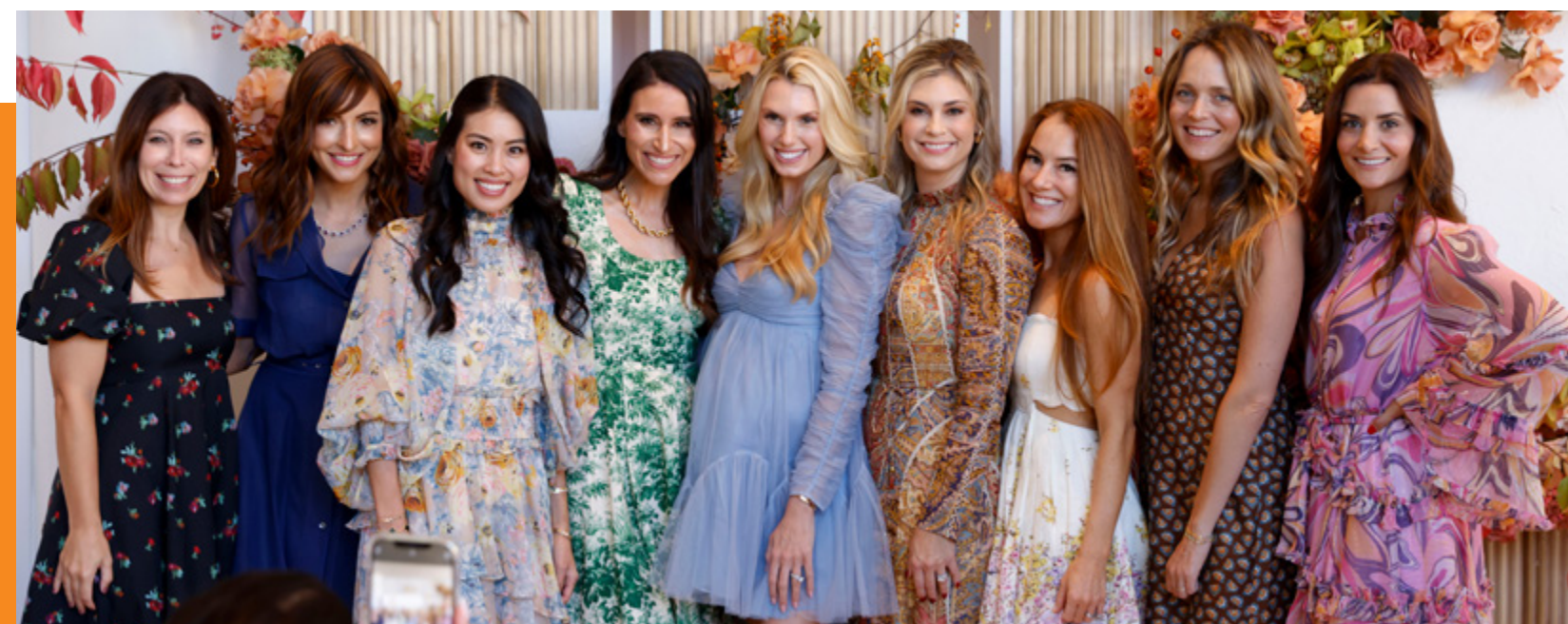
Harvesters and guests at the 31st Annual Fashion Show & Luncheon.