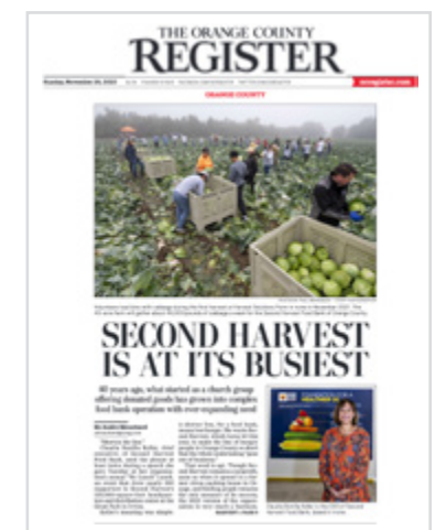
Orange County Register (November 26, 2023) | Second Harvest at its Busiest