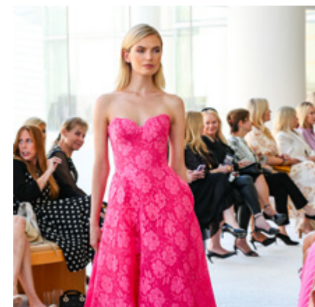
Model during Harvesters 31st Annual Fashion Show & Luncheon.