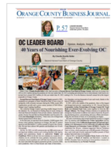
Orange County Business Journal (October 16, 2023) | OC Leader Board: 40 Years of Nourishing Ever-Evolving OC

SECOND HARVEST CAPTURED THE SPOTLIGHT WITH KEY MEDIA COVERAGE THIS QUARTER. HERE ARE JUST A FEW CLIPS: