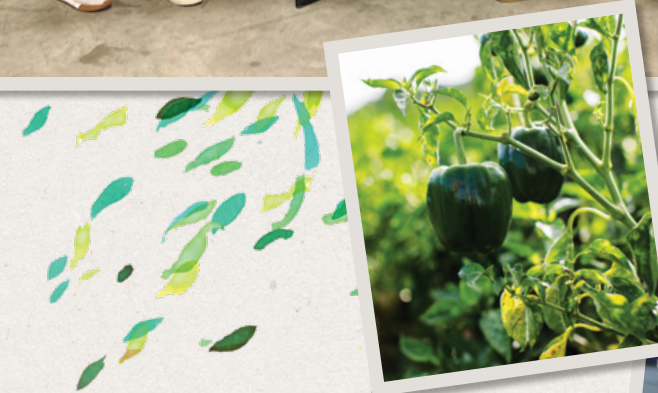
CLOCKWISE FROM ABOVE: New Harvesters members touring Second Harvest; SHFB's trucks ready to make deliveries throughout OC; Nutrient-rich fresh peppers growing at Harvest Solutions Farm in Irvine, CA.