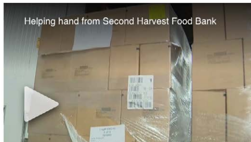
Helping hand from Second Harvest Food Bank

Wednesday's food drive benefits Second Harvest Food Bank in Orange County. To donate, click here .